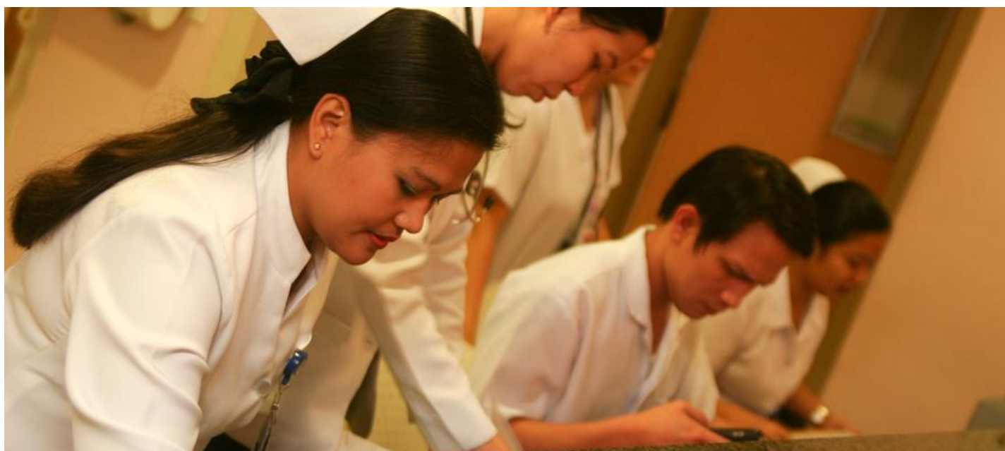
Filipino health professionals working at the nurse's station