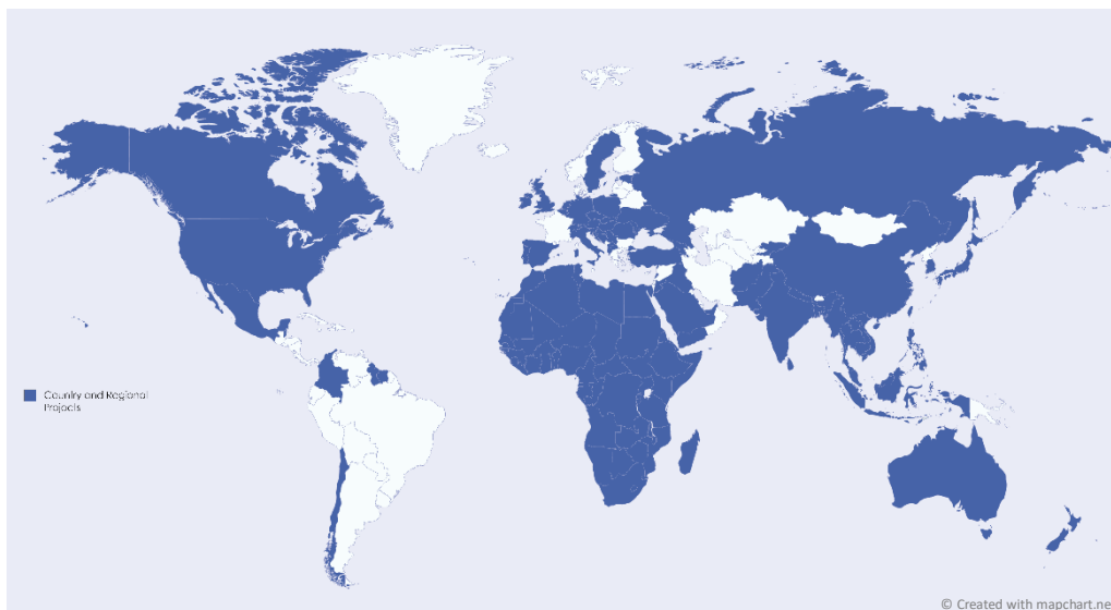
IOM's recent skills-related projects across the globe

IOM has developed special expertise in bringing multiple stakeholder together, aligning different policies, supporting migrants along the migration continuum and facilitating skills recognition.