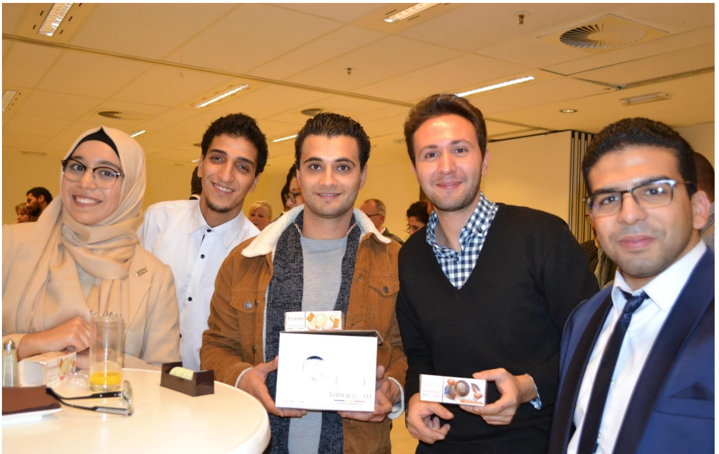
Beneficiaries of the project 'Enhancing Tunisian youth employability', Brussels © IOM 2018.