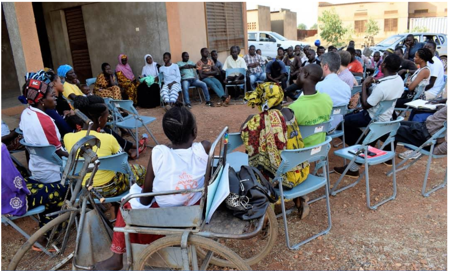
Information session with youngsters on entrepreneurship, 'Strengthening Youth Employability and Entrepreneurship in Burkina Faso' project © IOM 2018.