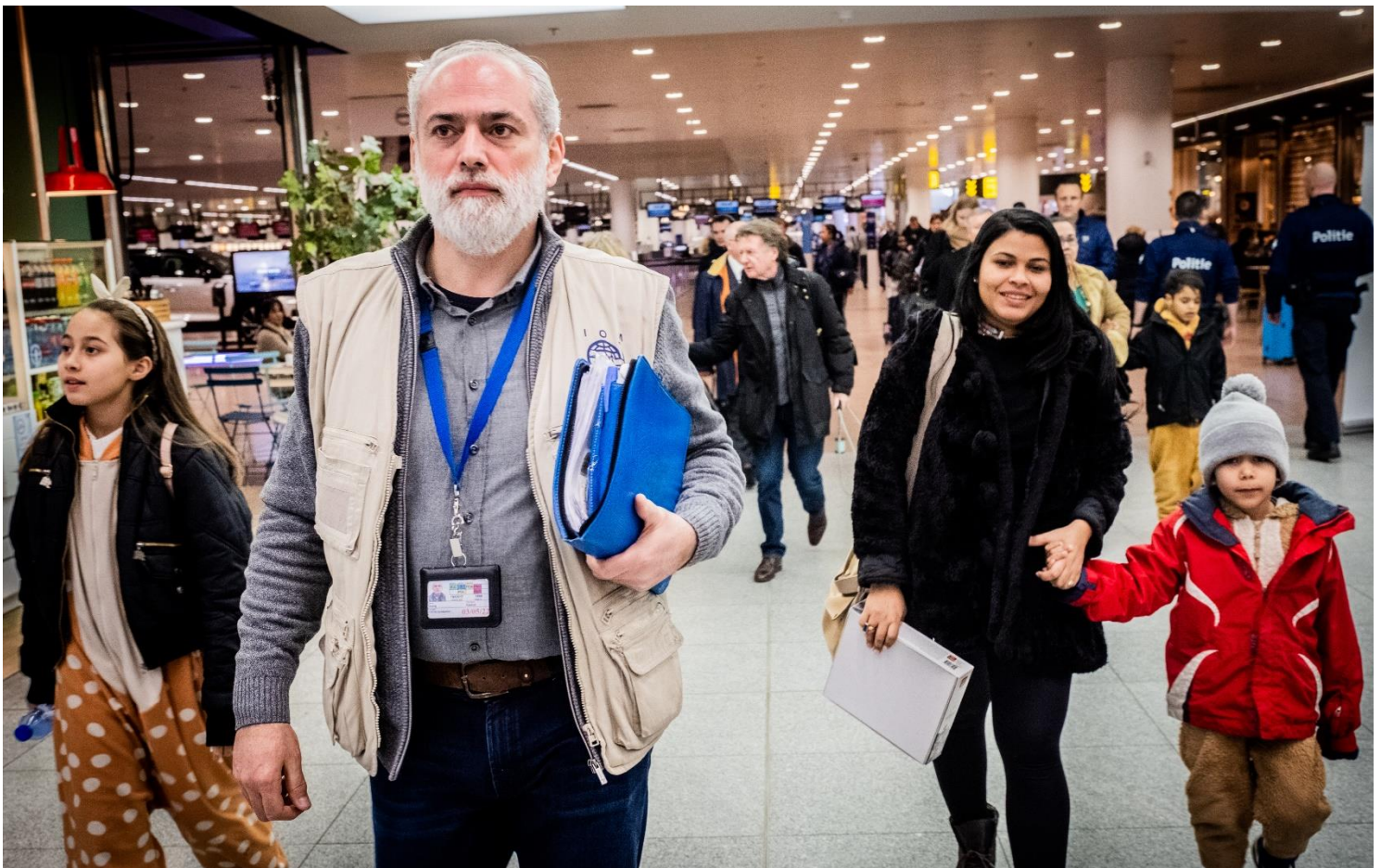
IOM assistance at Brussels Airport © Wouter Van Vaerenbergh – Fedasil 2019.